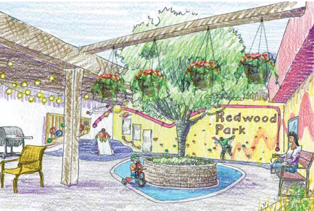
Drawings from the Preliminary Ideas and Concept plan for Redwood Park