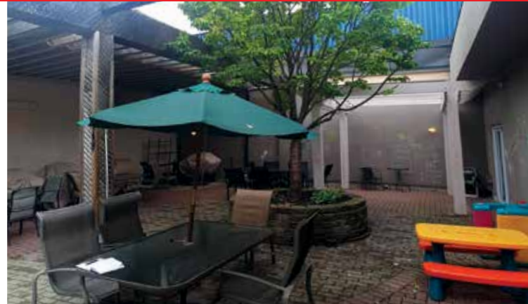
The Redwood courtyard, today

Tanisha shared this dream with friends of The Redwood — Donna Hinde and Tonya Crawford of the acclaimed design firm The Planning Partnership. Tanisha was just looking for a little advice. Would it even be possible to turn The Redwood’s internal courtyard — a gray and concrete square into a special playground?